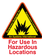
Pneumatic Jet Fan ASI-JF20